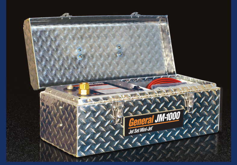
Mini-Jet includes Super-Flex<sup>™</sup> high pressure jet hose, 4 pc. nozzle set, water supply hose, shut-off valve, universal faucet adapter and threaded faucet adapter.