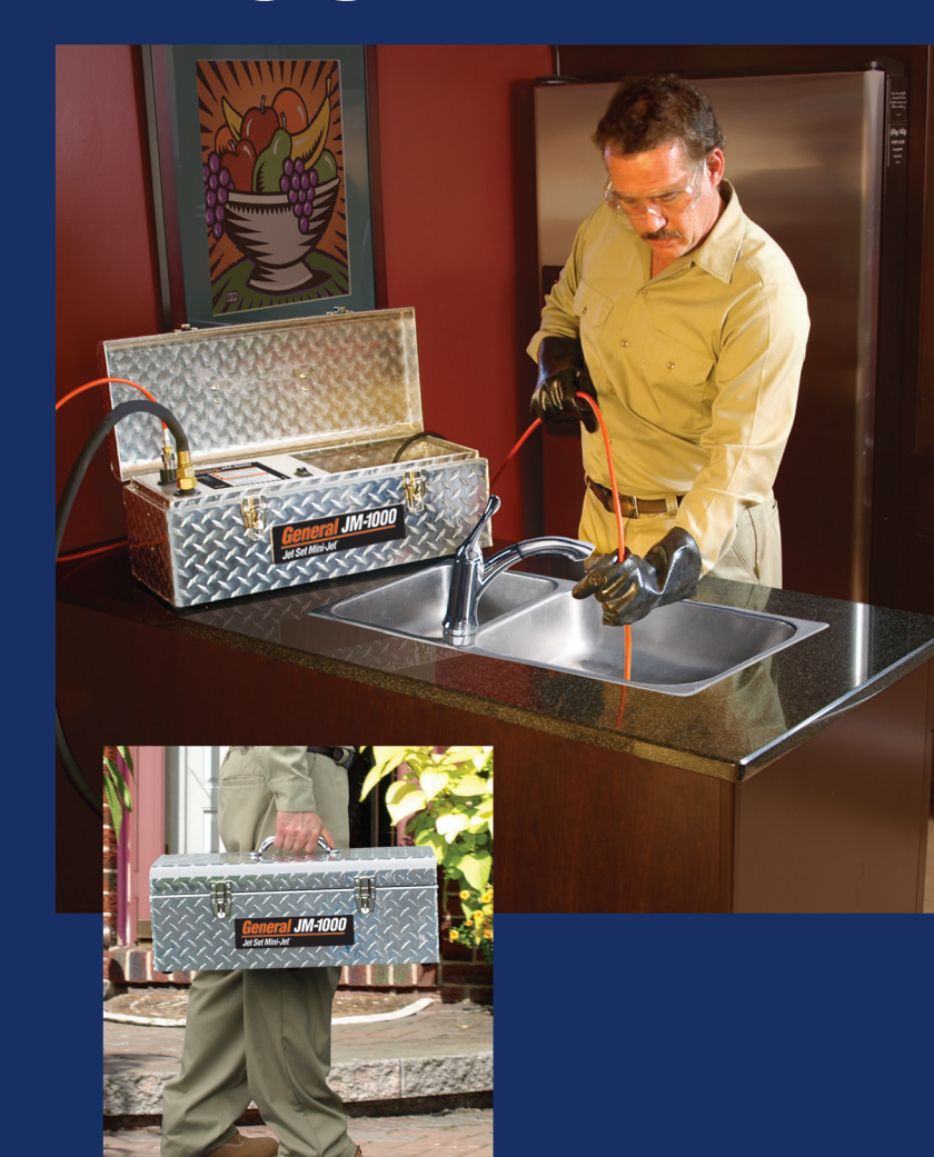
The lightweight, compact Mini-Jet weighs just 22 lbs. so it's small enough to store conveniently in your truck.

Pound for pound and dollar for dollar, the Mini-Jet is a great (and small) investment.