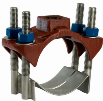
JCM 404 Service Saddle Outlet Sizes 3/4" – 1"

JCM 400 Series Service Saddles are ANSI/NSF Standard 61, Annex G and ANSI/NSF 372 Certified.