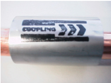
With arrows facing solder joint, slide over until flush with coupling