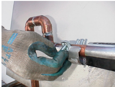
Spread open bottom section of clamp with nut facing out and slide on bottom half of clamp over top rubber section with arrows visible in the opening of bottom section.