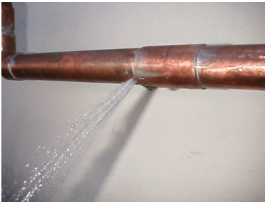
Leak at solder joint in copper pipe

(Fully lubricating gasket with soapy water will assist in reducing friction and help to evenly distribute the clamp on the pipe during installation.)