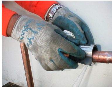
Loosen the bolt and separate the two parts of the clamp. Snap top half of clamp with rubber directly over leak